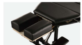
Two piece divided head cushion for secured, yet comfortable patients