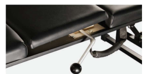
Toggle pelvic drop and toggle thoracic drop Adjustable tension and easy control levers