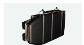
In a folded state the Arena is easily transported or stored